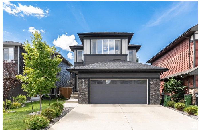
Main Floor Exterior Area 859.19 sq ft Interior Area 796.35 sq ft Excluded Area 531.35 sq ft

MLS® # E4446933 Price $619,900 Bedrooms 5 Bathrooms 3.50 Full Baths 3